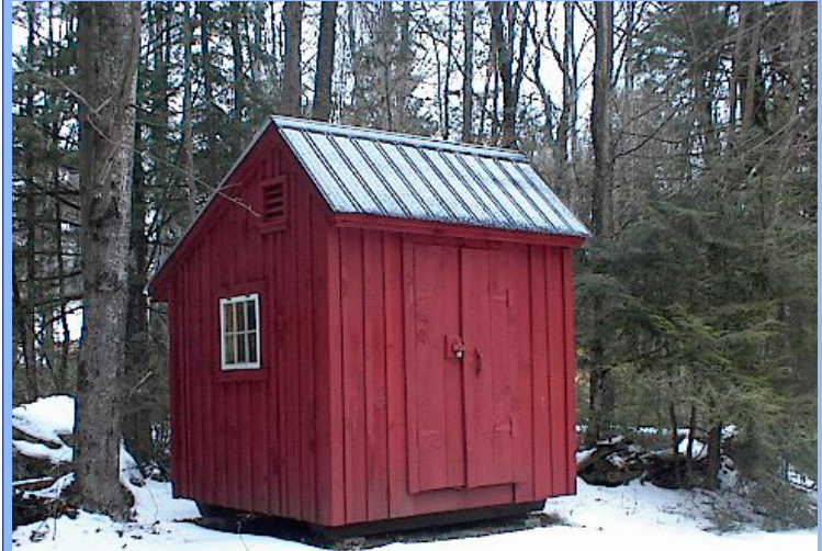
Photo may not show standard Option A, Please refer to floor plan below and specifications to the left.