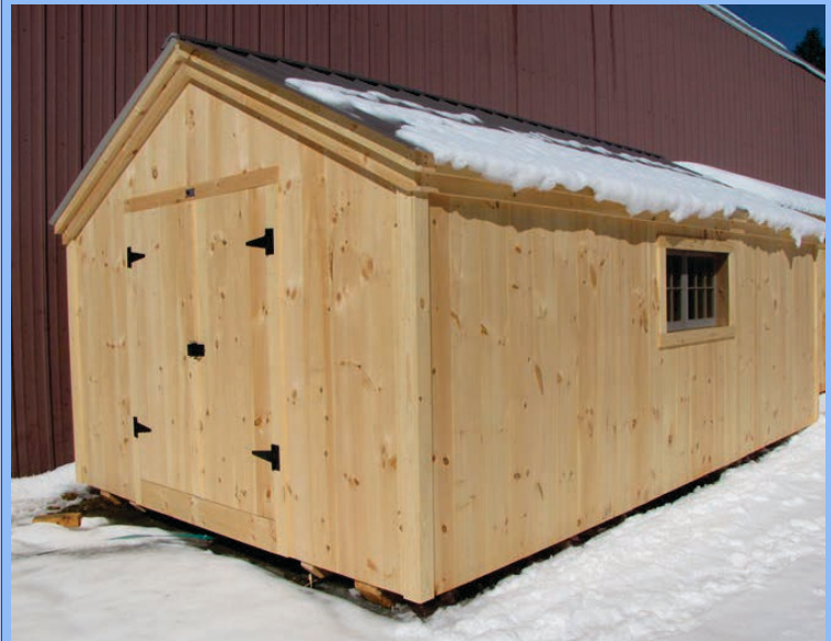
Photo may not depict standard Option A, Please refer to the floor plan below and the specifications to the left.