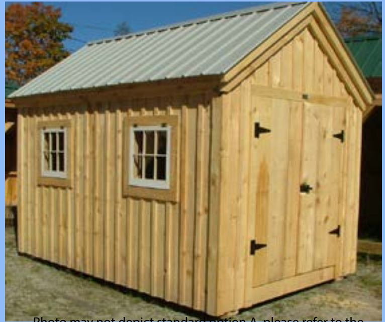
Photo may not depict standard option A, please refer to the floor plan below and the specifications to the left.