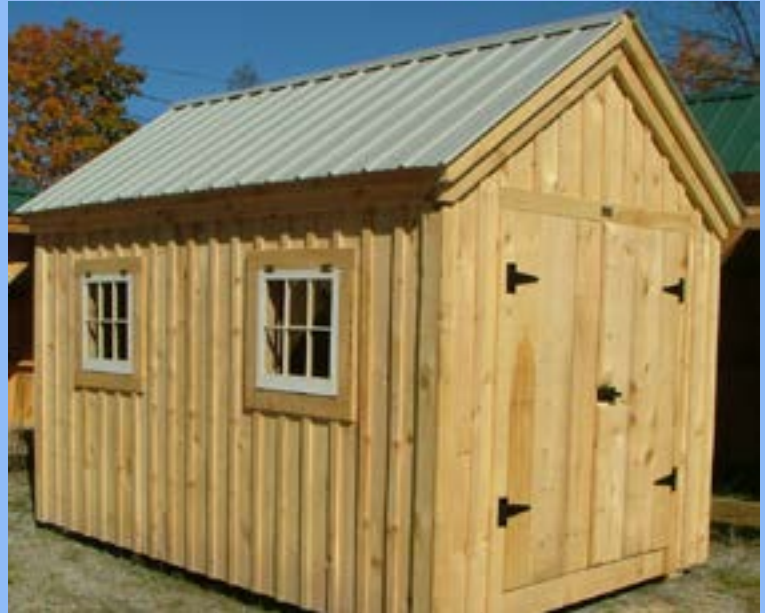
Photo may not depict standard option A, please refer to the floor plan below and the specifications on the left.