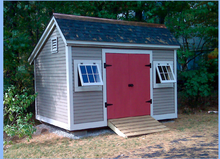
Photo may not depict standard Option A, please refer to Floor Plan below and Specifications to the left.