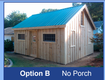
Option B No Porch