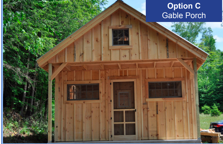
Option C Gable Porch

Assembly Time: Two People Forty Two Hours