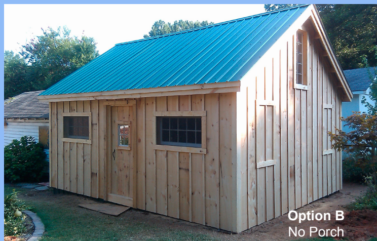
Option B No Porch

Visit www.JamaicaCottageShop.com/16x20vc.asp for more details