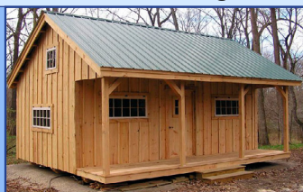
Option A Bearing Wall Porch