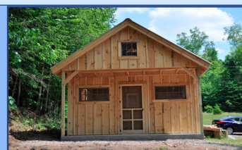
Option C Gable Porch