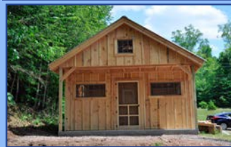
Option C Gable Porch