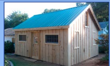
Option B No Porch