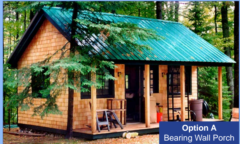
Option A Bearing Wall Porch

Recommended Foundation: 18'x22' pad compacted crushed stone 8-12" deep