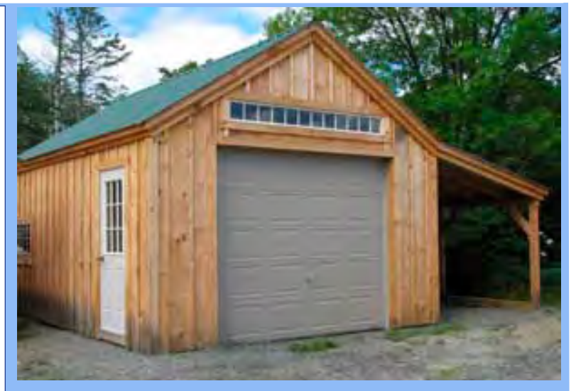
Photo may not depict standard Option A, please refer to the floor plan below and the specifications to the left.

Shipping Cubes: 42"x40"x168" 42"x40"x120"