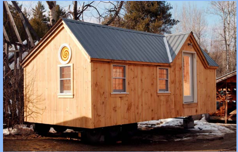
Model pictured above is fully insulated and has many modifications. See "Additional Options" below or call a Cottage Associate at (866) 297 3760 for more information.