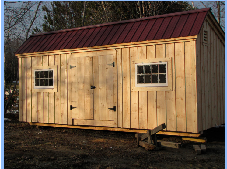
Photo may not depict standard Option A, please see Floor Plan Below and Specifications to the left.

Estimated Assembly Time: One Person, 32 hours