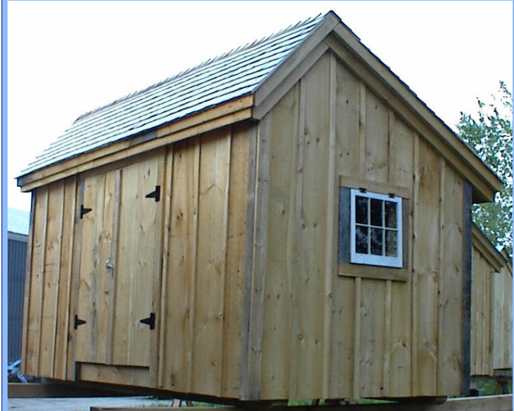
Photo may not show standard Option A, Please refer to floor plan below and specifications to the left.

Fully assembled from native rough sawn lumber here at our manufacturing facility, this design is delivered to your client prepared, truck accessible site in one piece. The building is set and leveled by our delivery crew and ready to use when we leave your site. Due to road restrictions, fully assembled models are available in the northeastern United States only.